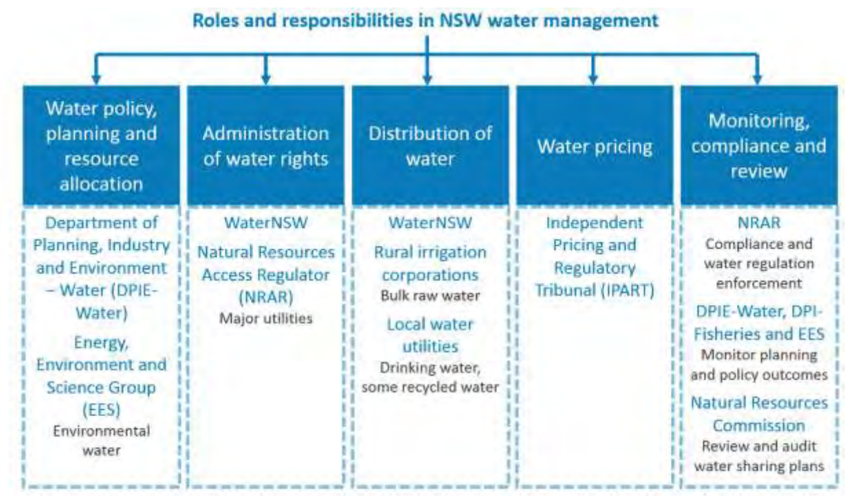
Figure 1: Roles and responsibilities in rural and regional water management<sup>3</sup>