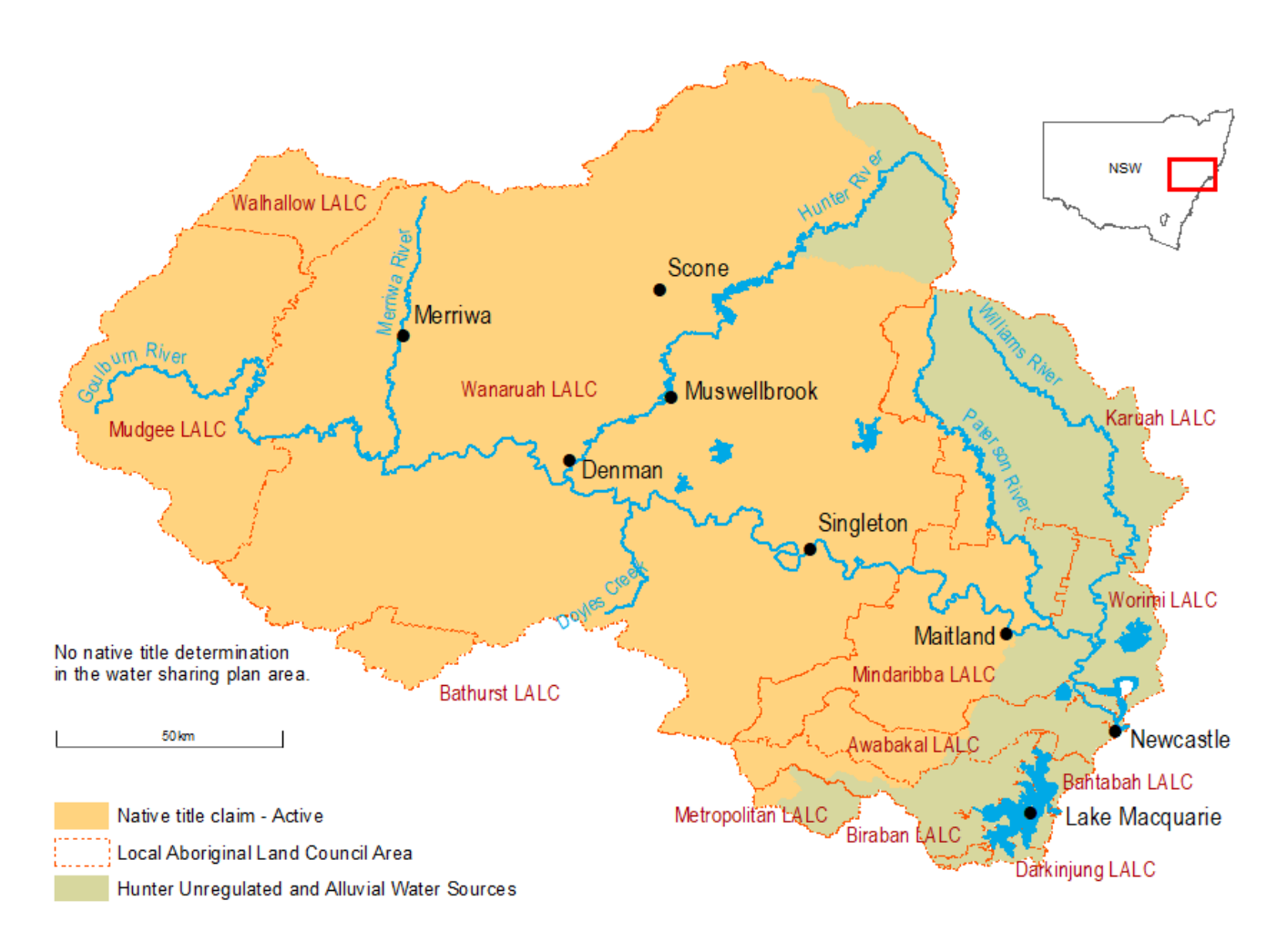
Figure 4: Native title claims and Local Aboriginal Land Council areas in the Plan area<sup>89</sup>